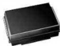
SMB (DO - 214AA)